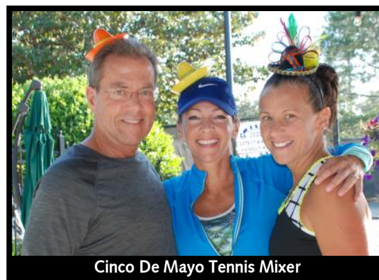
Cinco De Mayo Tennis Mixer