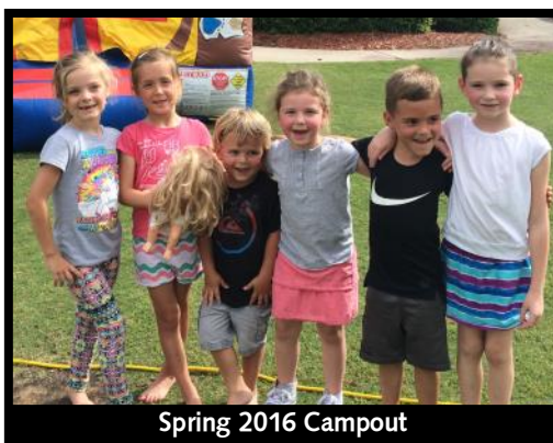
Spring 2016 Campout