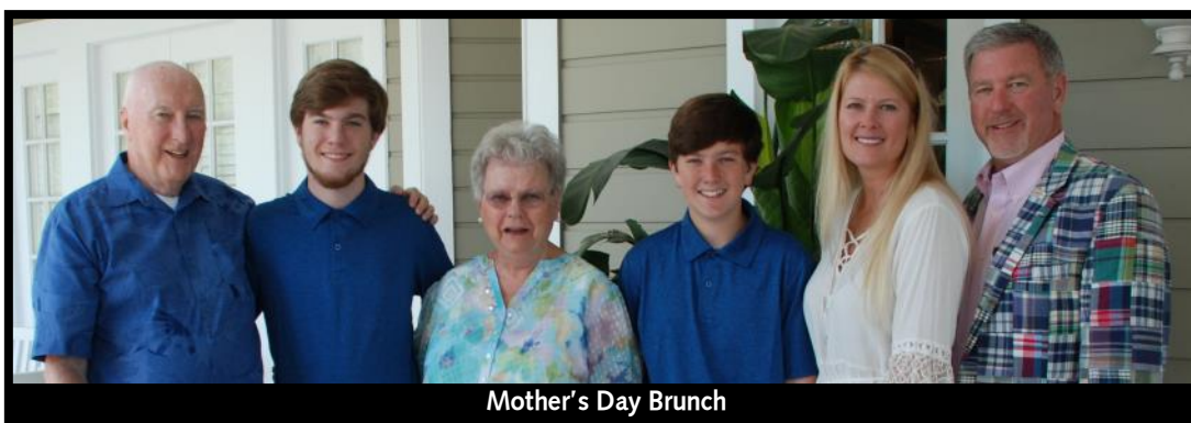
Mother's Day Brunch