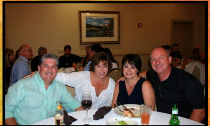
Prime Rib Buffet & Pop Culture Trivia Night