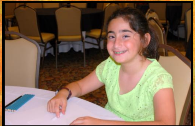
Kids' Art Lesson: Still Life