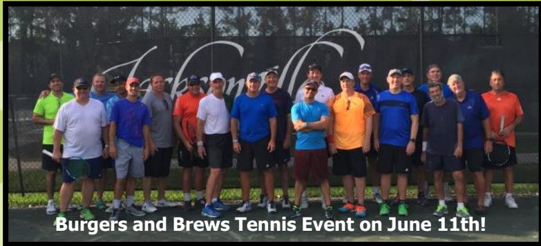
Burgers and Brews Tennis Event on June 11th!