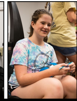
Tween Event: Crochet for a Cause from June 7th