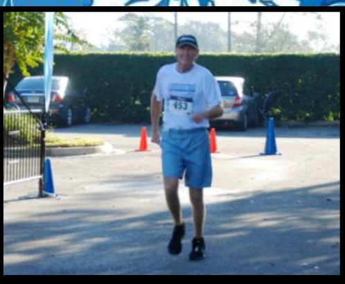
1st Annual Reindeer Run 5k on December 13th!