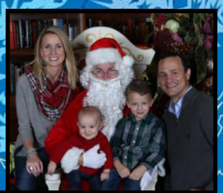
Santa Brunch on December 6th!