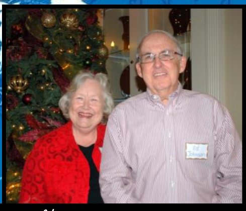
Member Holiday Party on December 2nd!