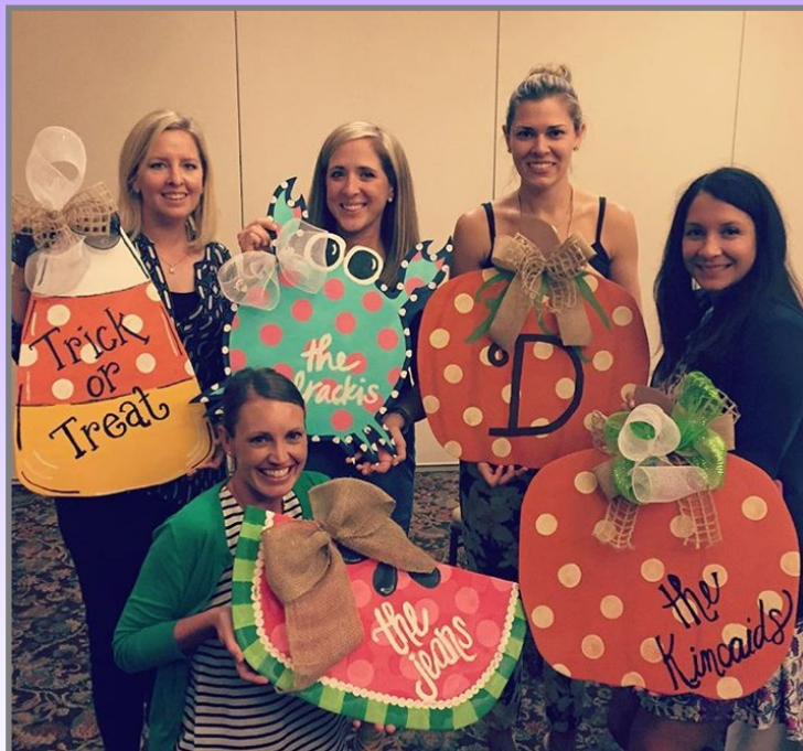
Ladies Night, August 30, 2016