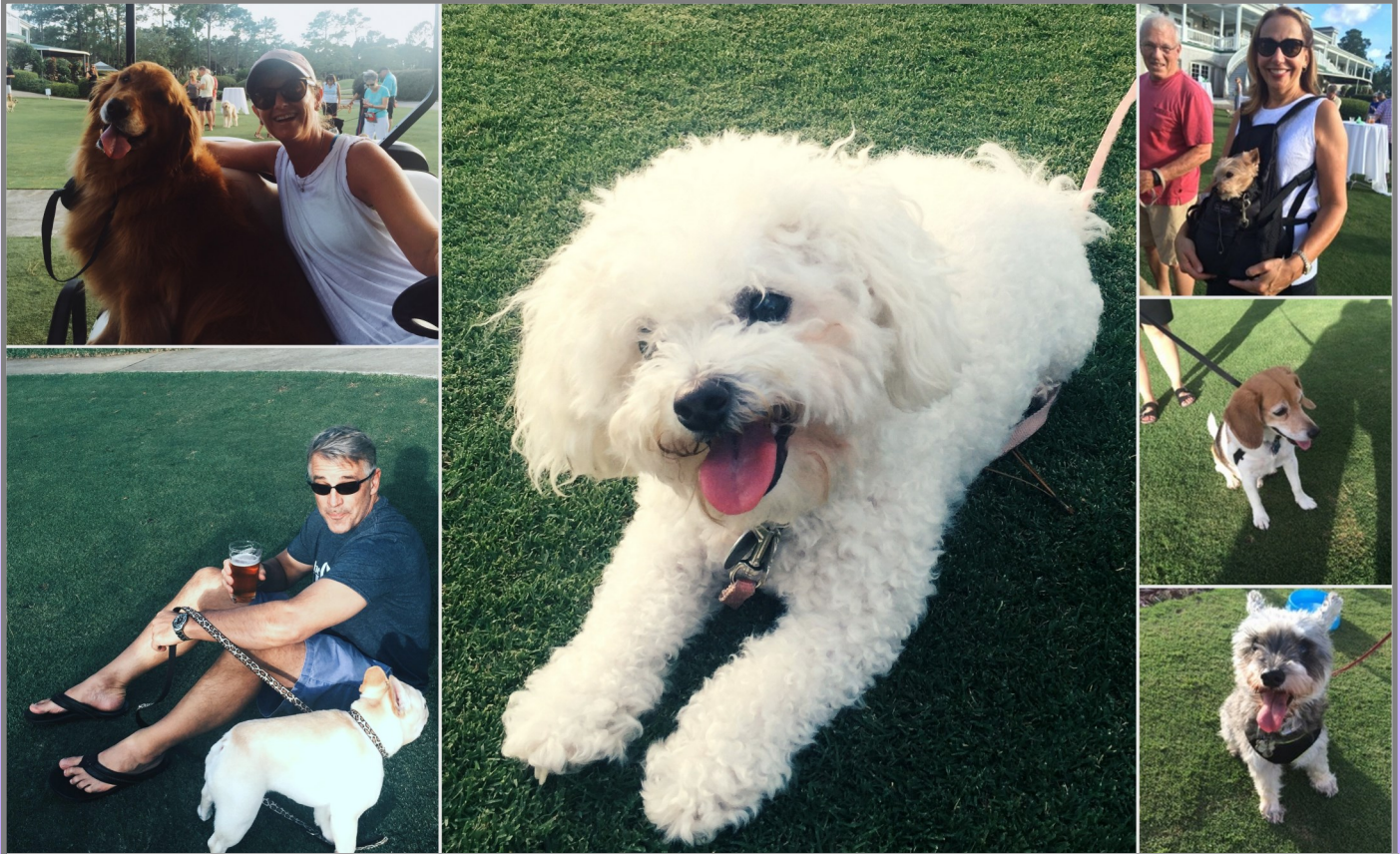
Yappy Hour at the Club, August 26, 2016